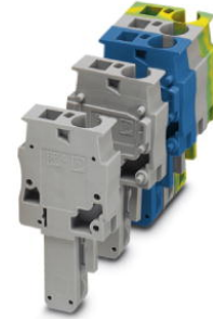
Illustration shows versions of the SP 4/1-... connector in various colors

http://eshop.phoenixcontact.de/phoenix/treeViewClick.do?UID=3042751